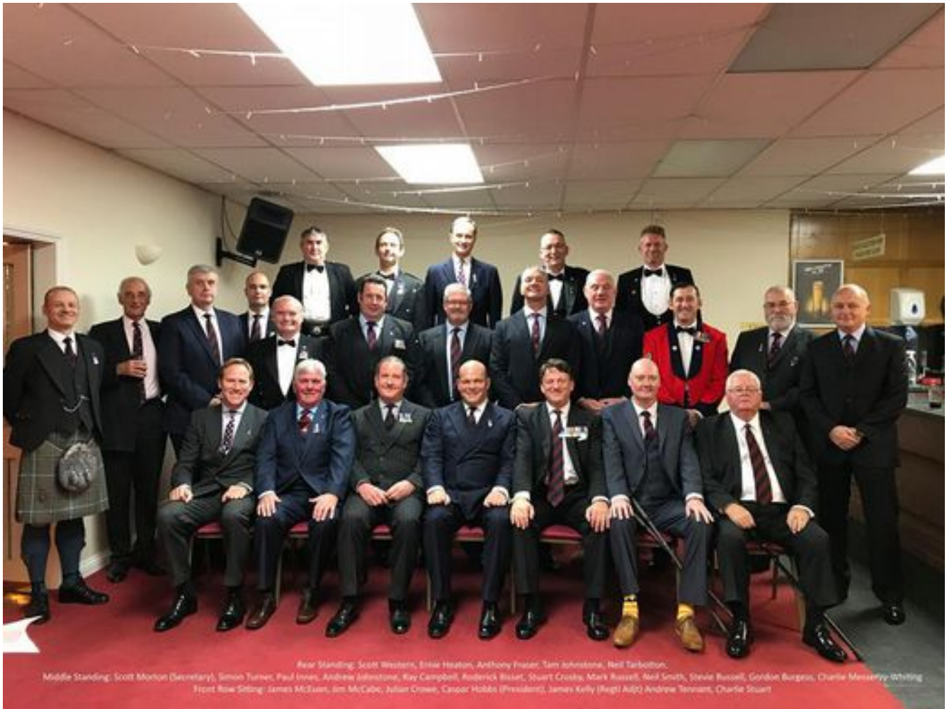
The founder members of the Corby Branch at the Dinner.