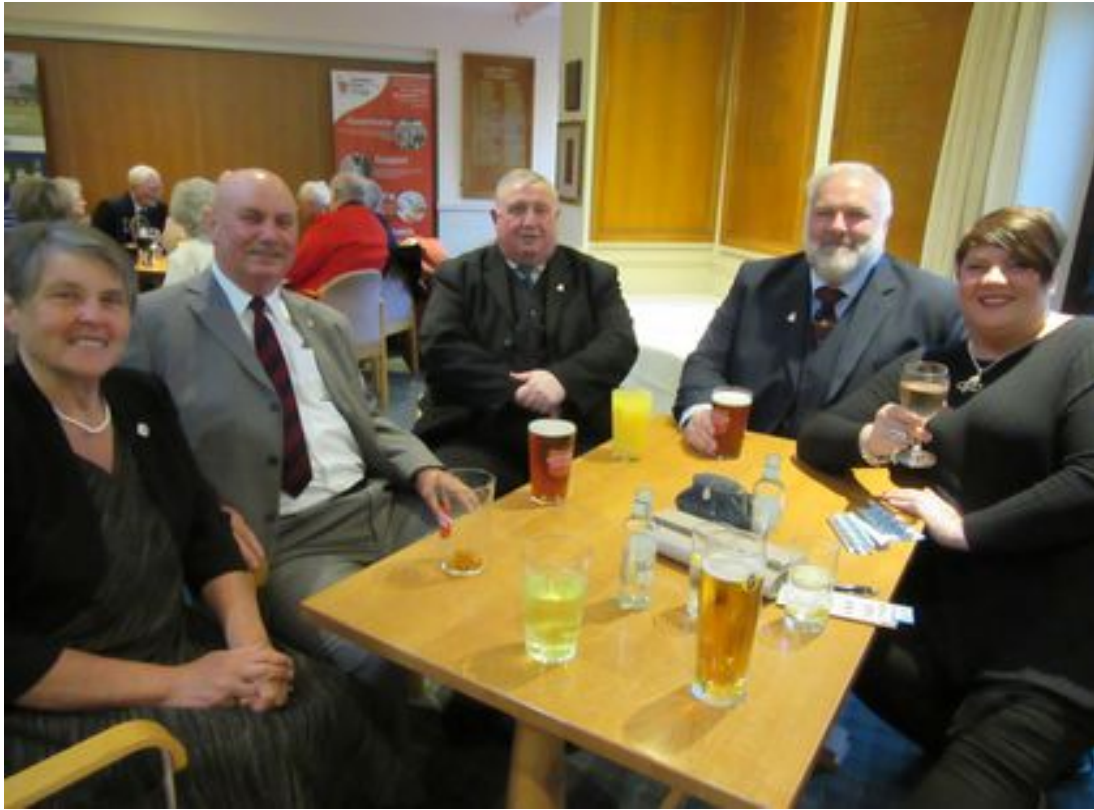
Branch Guests enjoying the dinner