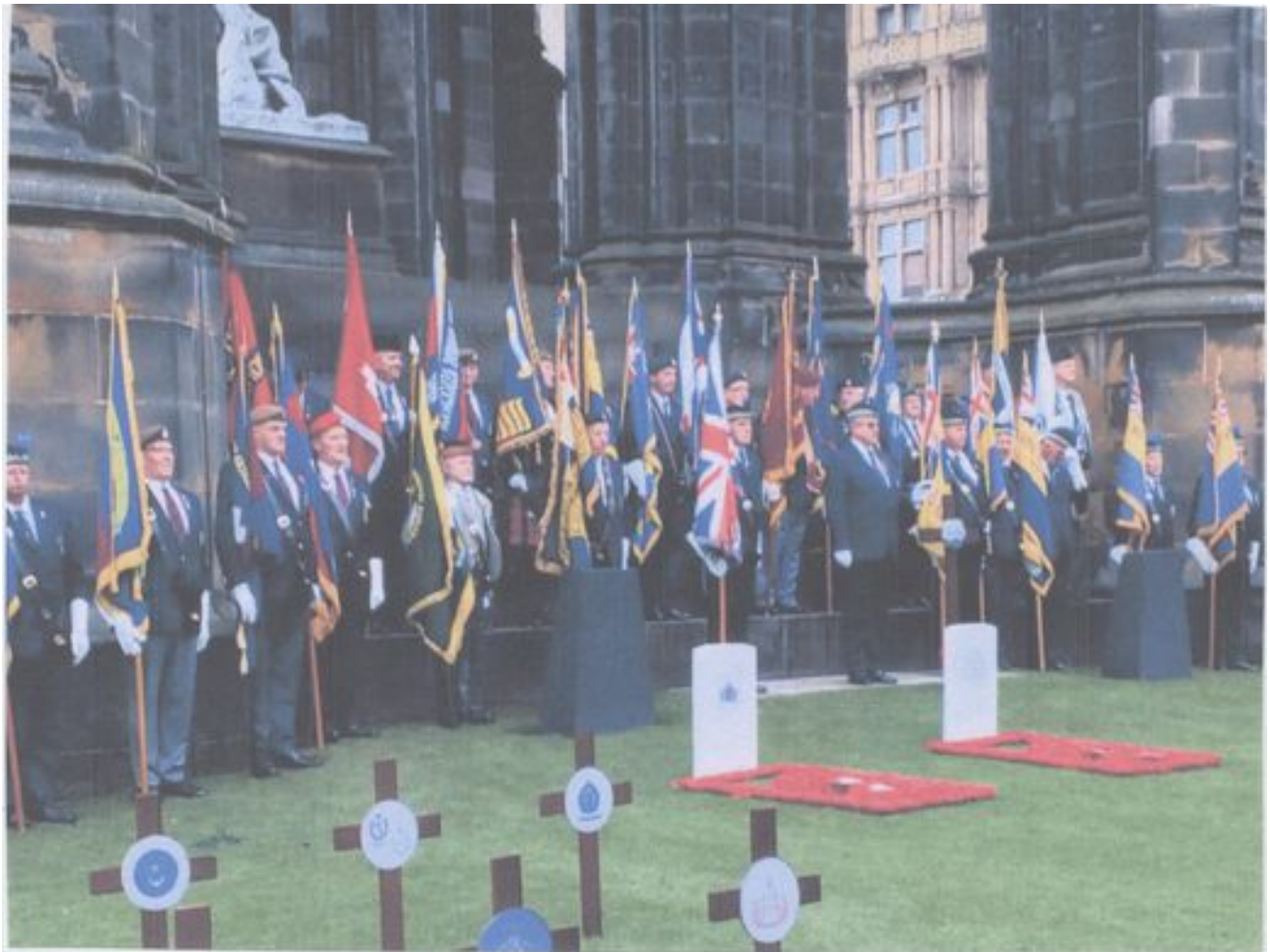
The Association and Branch Standards on Parade in Edinburgh on the 31 st October 2017

There were members from Edinburgh and the Lothians, Fife and Ayrshire Branches.