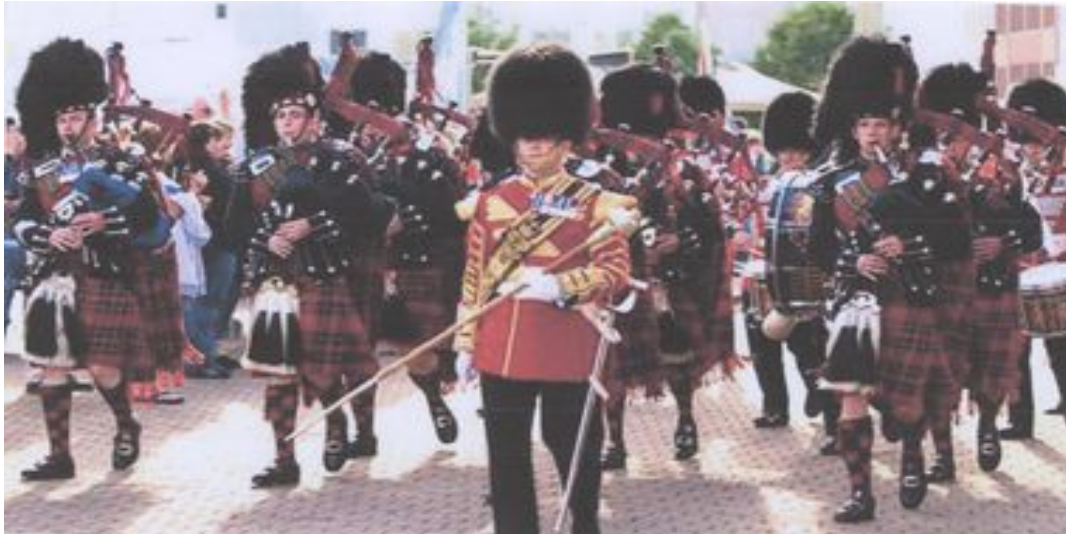
The Pipes & Drums of the 1 st Battalion on Parade

Best Marching and Deportment Grade Three: 1 st Battalion Scots Guards