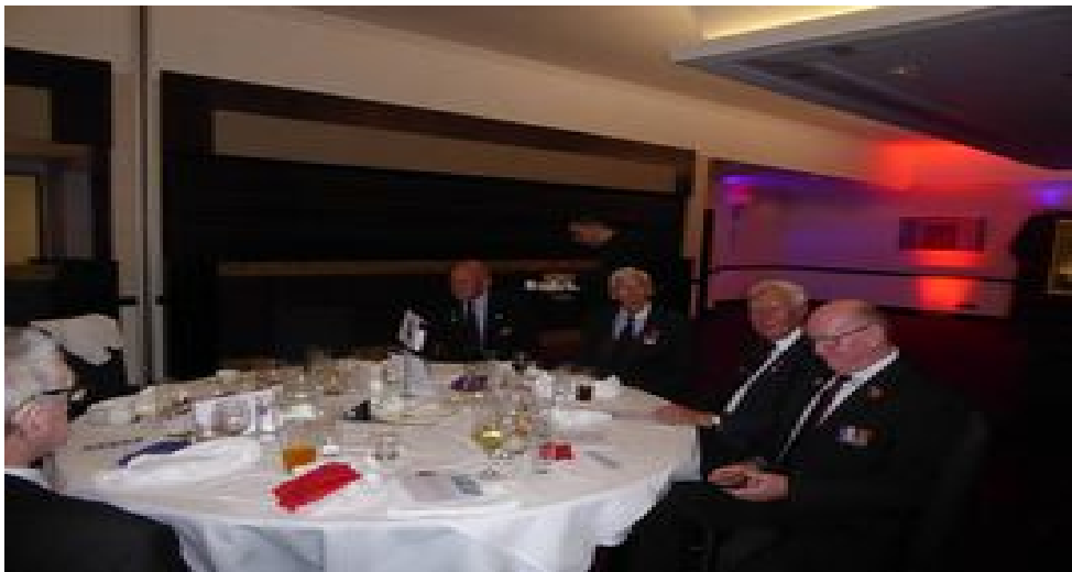
Branch members at the dinner